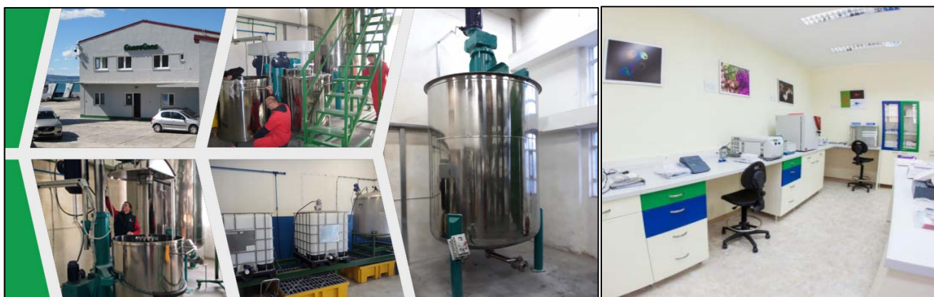
Integrated Solutions - new manufacturing facility, logistics center, laboratory, and warehouse located in Split's harbor.

standards. Each batch is tested on-site according to high standards which allow CorteCros® to provide valuable services to its customers.